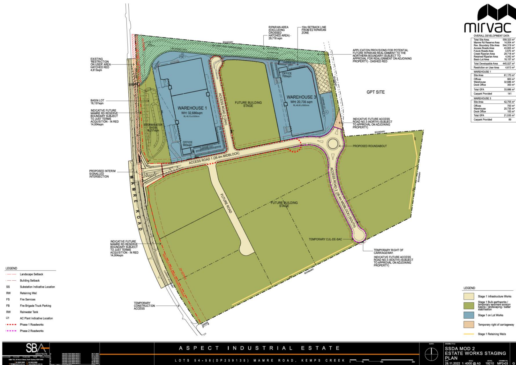
Figure 2: Stage 1 Plan