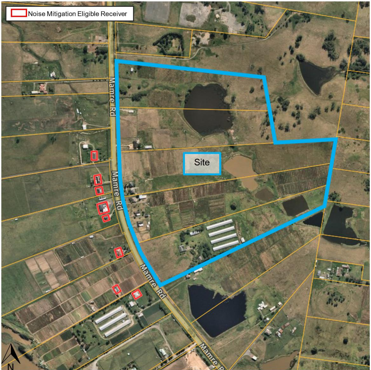
Figure 7: Noise mitigation eligible receivers to the west of Mamre Road