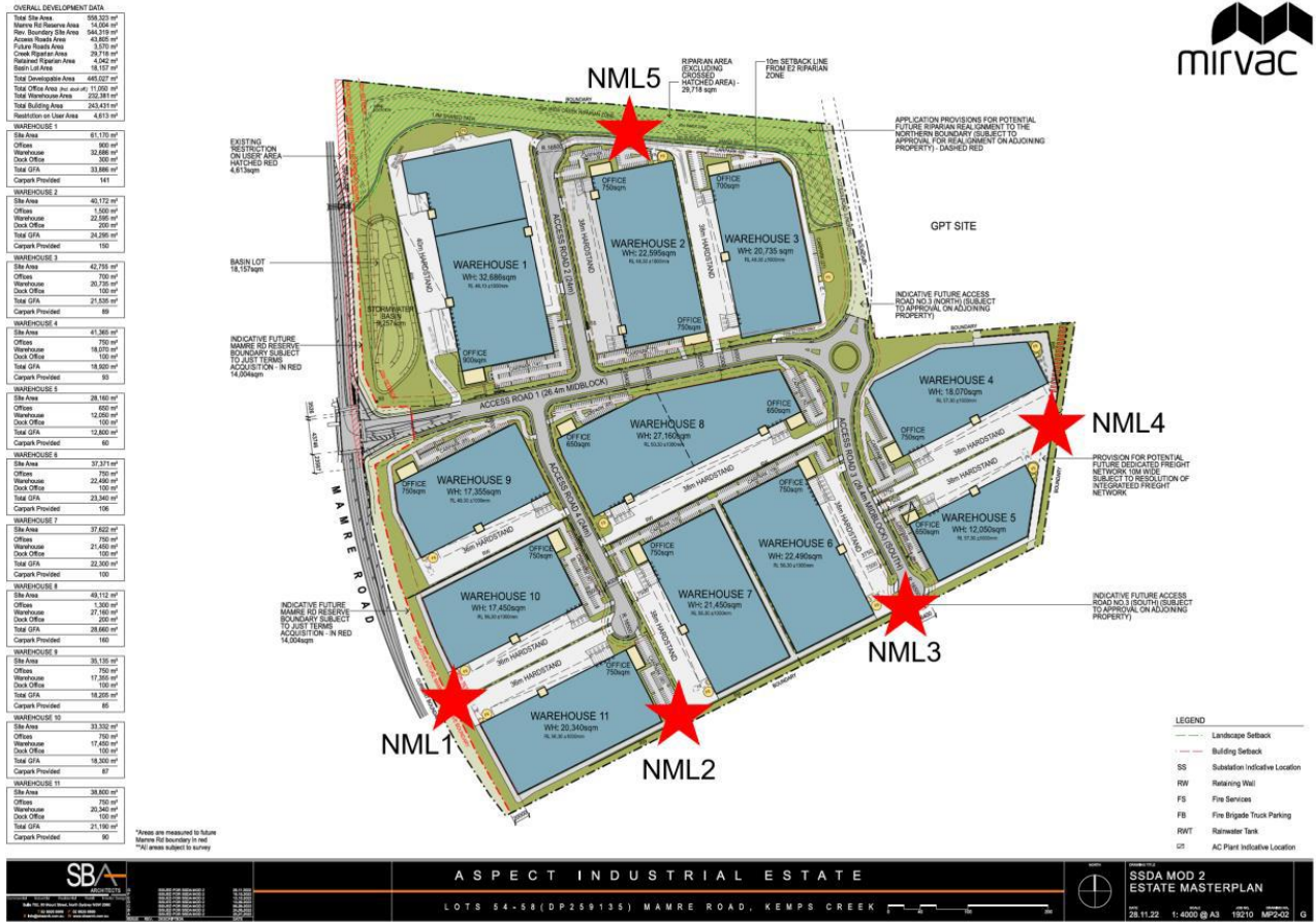
Figure 6: Noise Monitoring Locations Plan