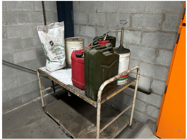
Photo 02. Unlabelled containers (presumed diesel) without secondary containment in Electrical Switch Room.