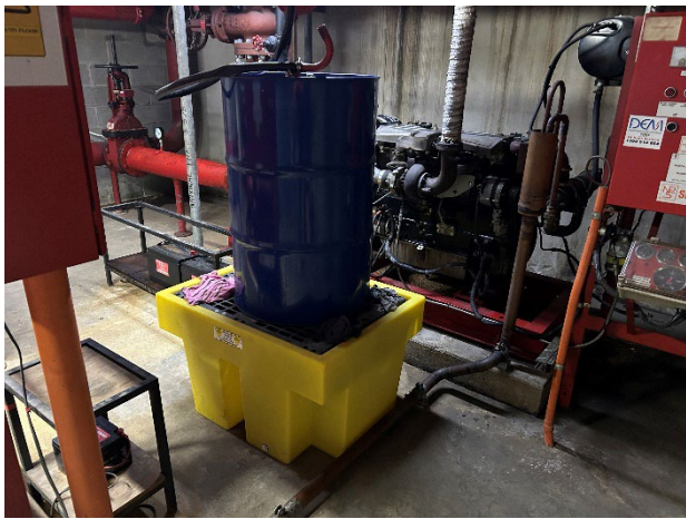
Photo 01. Unlabelled container (presumed diesel) in Sprinkler Pump Room.