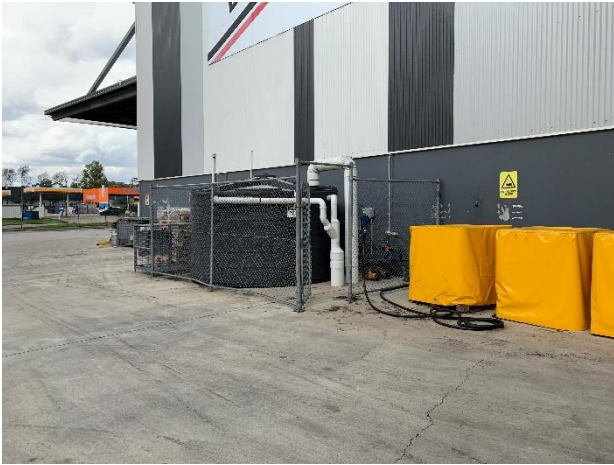
Photo 3 North side of building, water tank