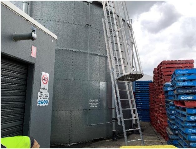
Photo 1 East side of building sprinkler water tank x 1