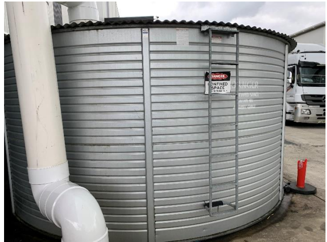
Photo 4 South west corner of building, water tank.