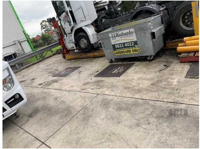
Photo 2 North west corner of building, underground pits x 7