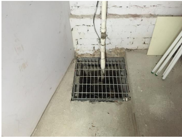
Photo 1. Confined Space 1.