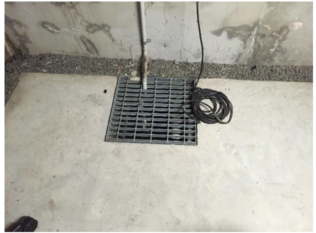
Photo 2. Confined Space 2.