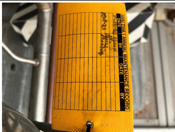
Photo 02. Out of date inspection tag on emergency eye wash/shower in Cooling Tower Room.