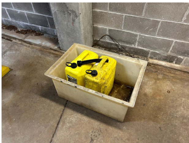
Photo 05. Diesel in Fire Pump Room.