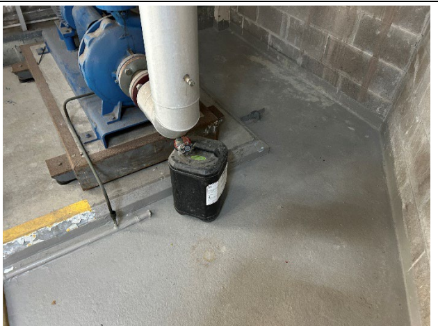
Photo 10. Hydro 428 container stored without secondary containment in Boiler Room.