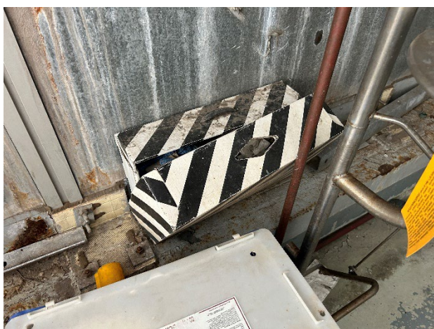
Photo 03. Inadequate spill kit in Cooling Tower Room.