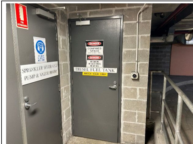
Photo 07. No COMBUSTIBLE LIQUID placard at entrance to Diesel Tank Room.