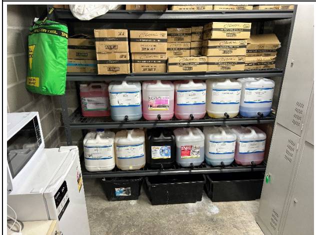
Photo 09. Hazardous chemicals stored without adequate secondary containment in Cleaners Store Room.