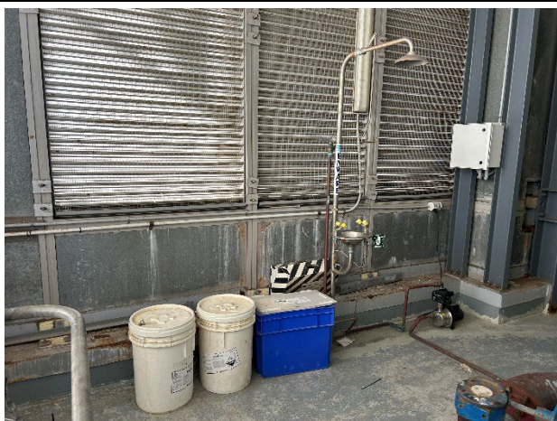
Photo 01. Hazardous chemical storage and emergency eye wash/shower in Cooling Tower Room.