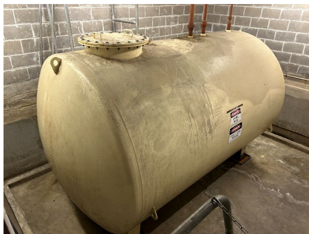
Photo 06. Diesel tank in Diesel Tank Room.