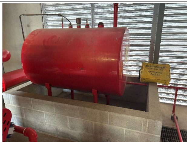
Photo 03. Diesel tank and small spill kit in Northern Fire Pump Room.