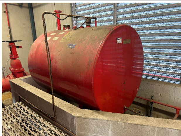
Photo 01. Diesel tank in Southern Fire Pump Room.