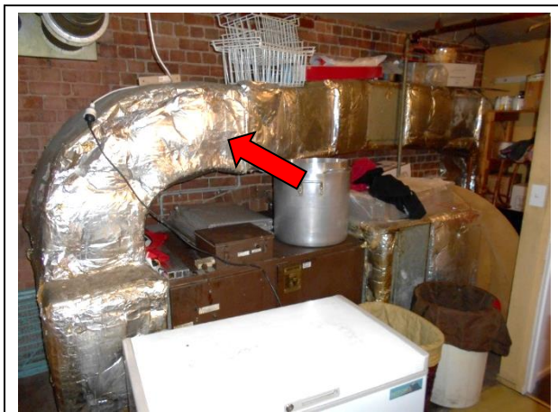
Photo 2: Level 1, Restaurant Plant Room, Ductwork – SMF insulation