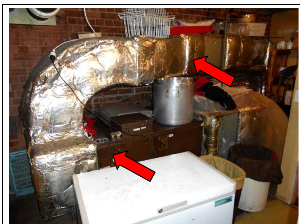
Photo 1: Level 1, Restaurant Plant Room – Suspected mastic sealant attached to ductwork and exhaust fan