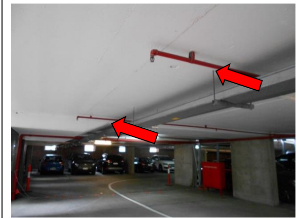
Photo 3: All Levels, Fire Sprinkler Pipework – Positive lead paint sample (red colour paint)