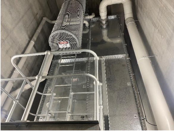
Photo 07. Level P6, OSD room water tank