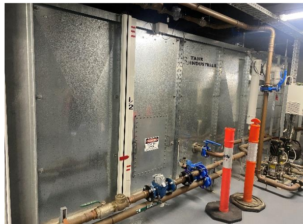
Photo 06. Level 39, plant room, water tank