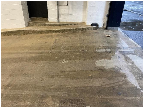
Photo 03. Loading Dock, Adjacent Vehicle Entrance, Unknown Underground Pits