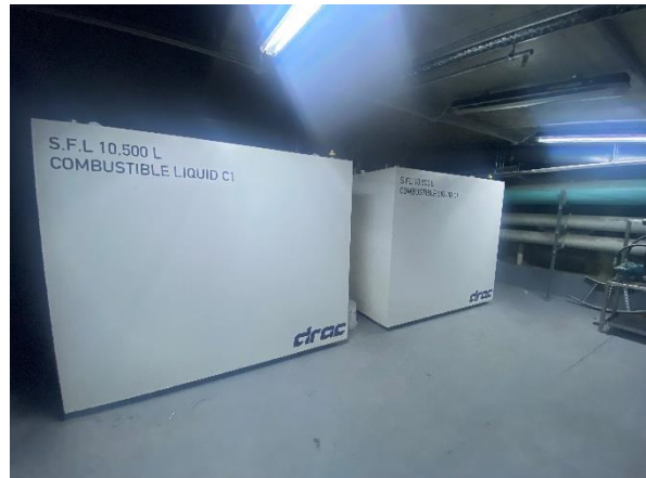
Photo 04. Loading Dock, Diesel Tank and Pump Room, 2 x Diesel Tanks