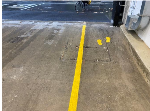
Photo 02. Loading Dock, Adjacent Vehicle Entrance, Unknown Underground Pits