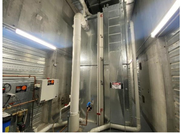
Photo 08. Level P6, OSD room water tank