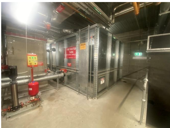
Photo 05. Loading Dock, Fire Control Room, 2 x 25,000L Water Tanks