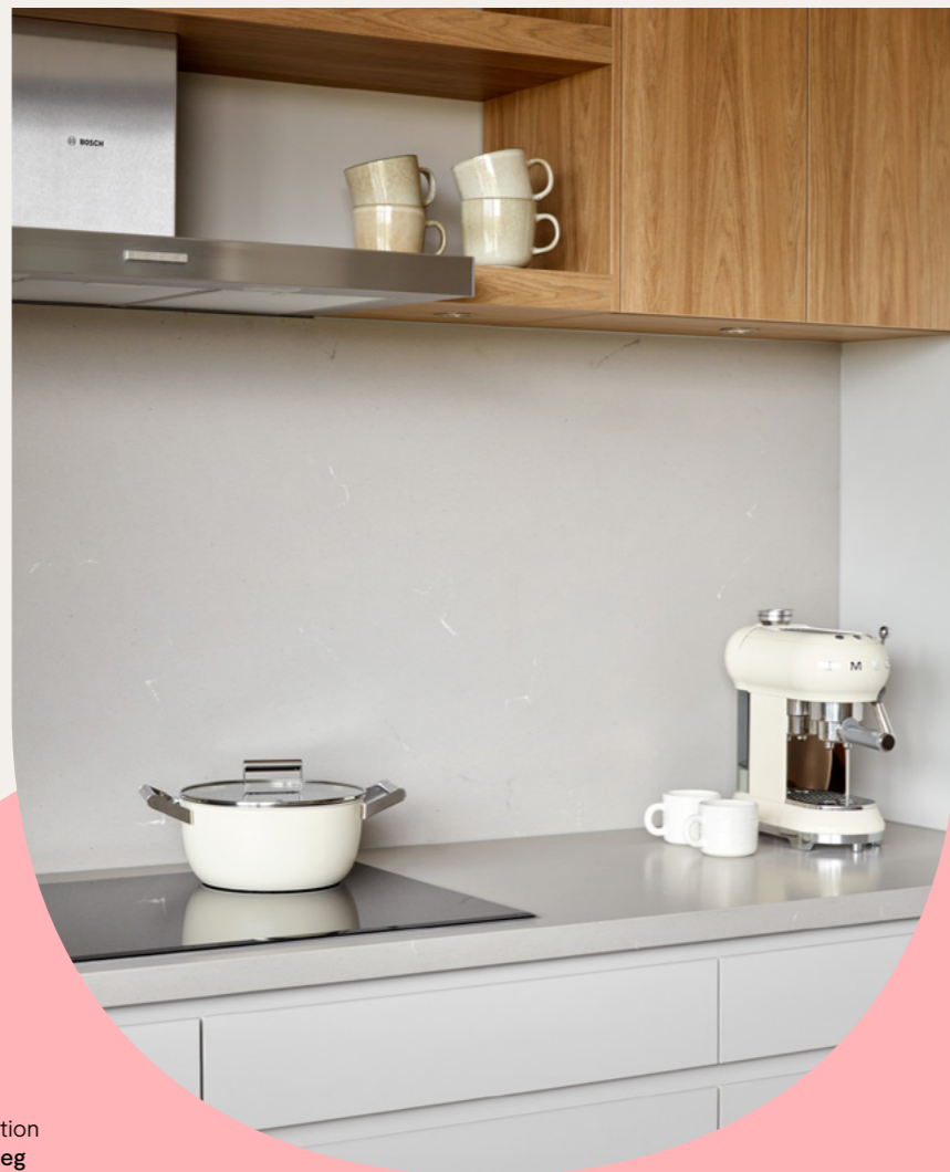
Products featured Coffee Machine and Induction Cooktop Cookware by Smeg