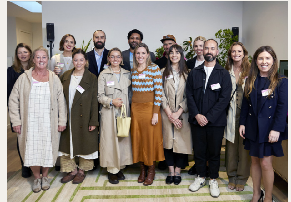
Our Valued Partners Future Ready Display Home Launch Event