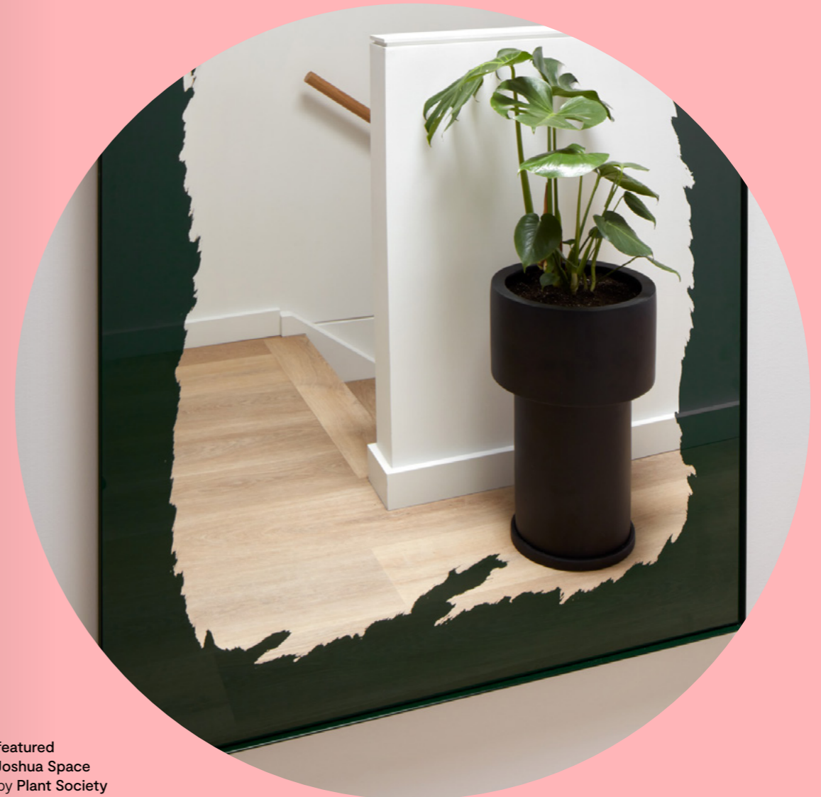
Products featured Mirror by Joshua Space Greenery by Plant Society

Livable homes include key easy living features including; step-less entries, accessible ground floor showers and WC's, stairways designed to reduce likelihood of injury and reinforced walls in bathrooms and ensuites to support the installation of handrails at a later date. These features make the homes safer and more accessible for all occupants including people with disability or temporary injuries, the elderly, and families with young children.