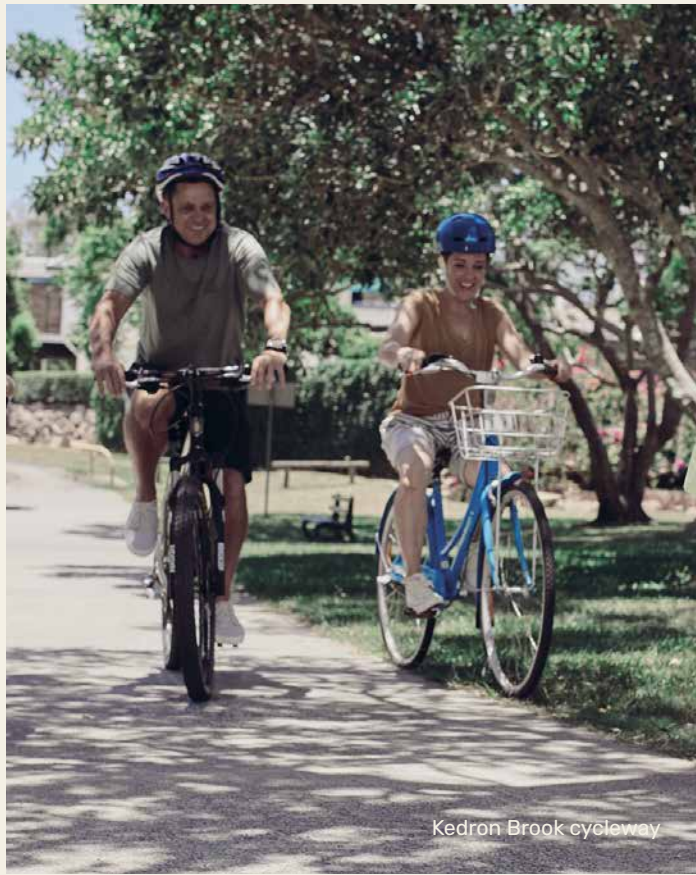
Kedron Brook cycleway