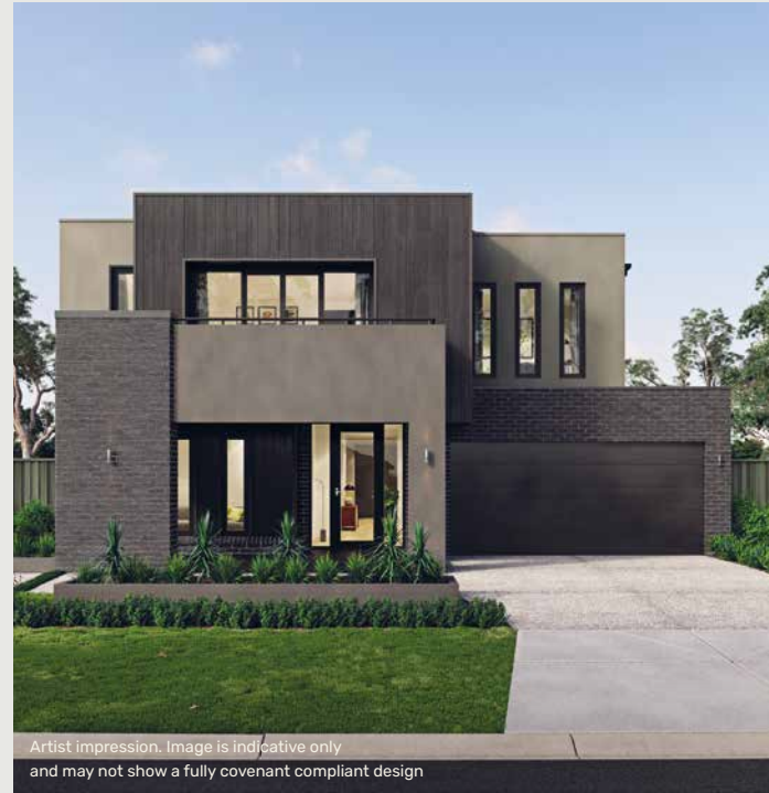
Artist impression. Image is indicative only and may not show a fully covenant compliant design