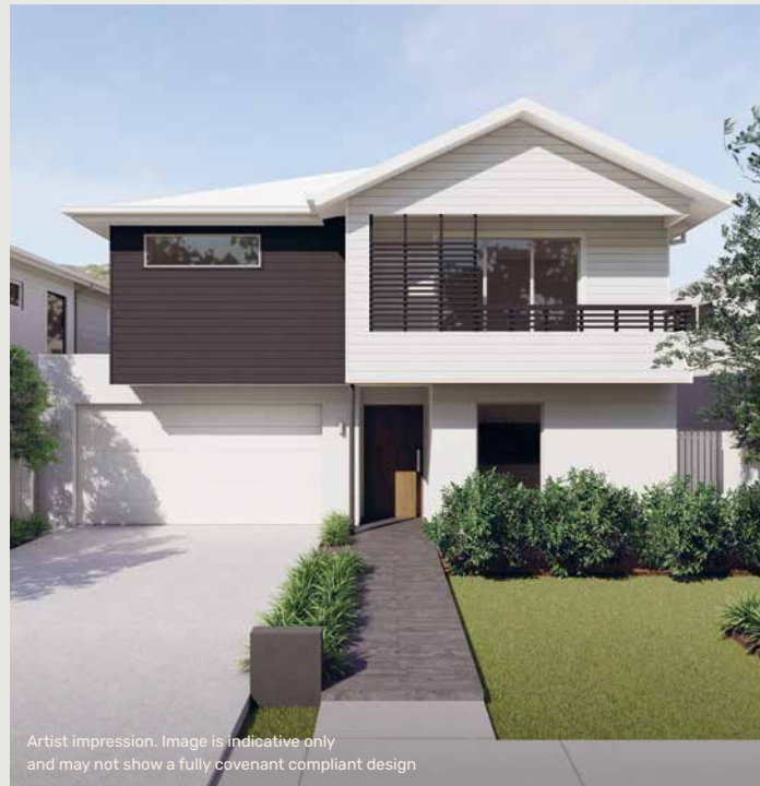
Artist impression. Image is indicative only and may not show a fully covenant compliant design