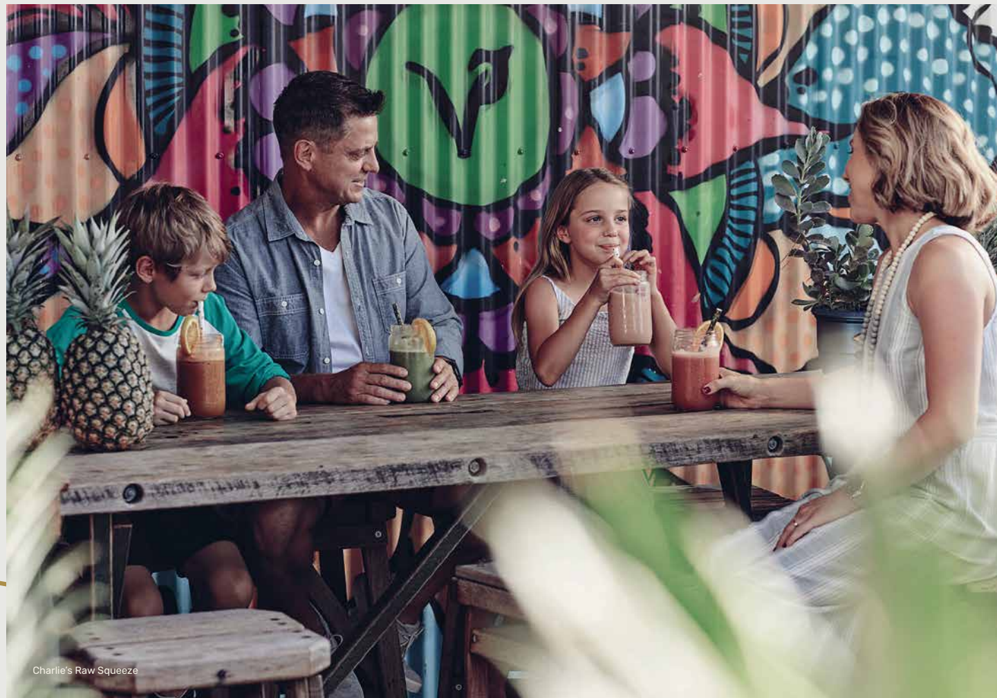
Charlie's Raw Squeeze