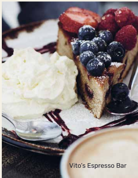
Vito's Espresso Bar