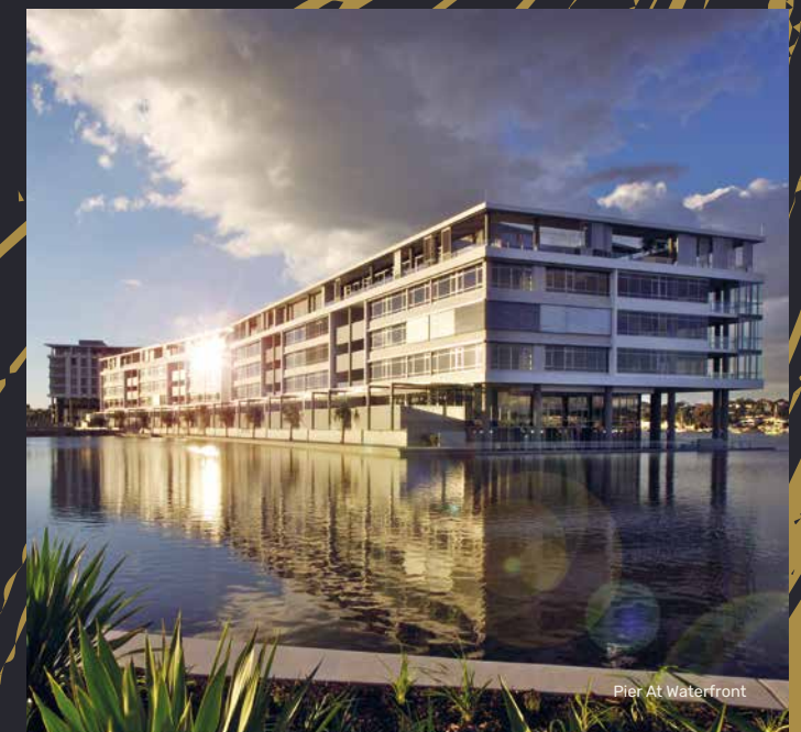
Pier At Waterfront

It's in the detail. residential.mirvac.com