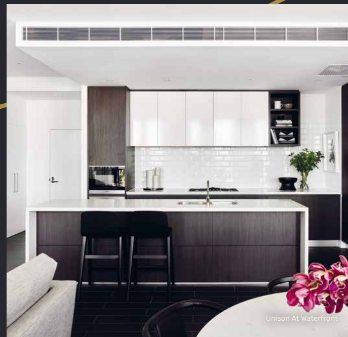
Unison At Waterfront