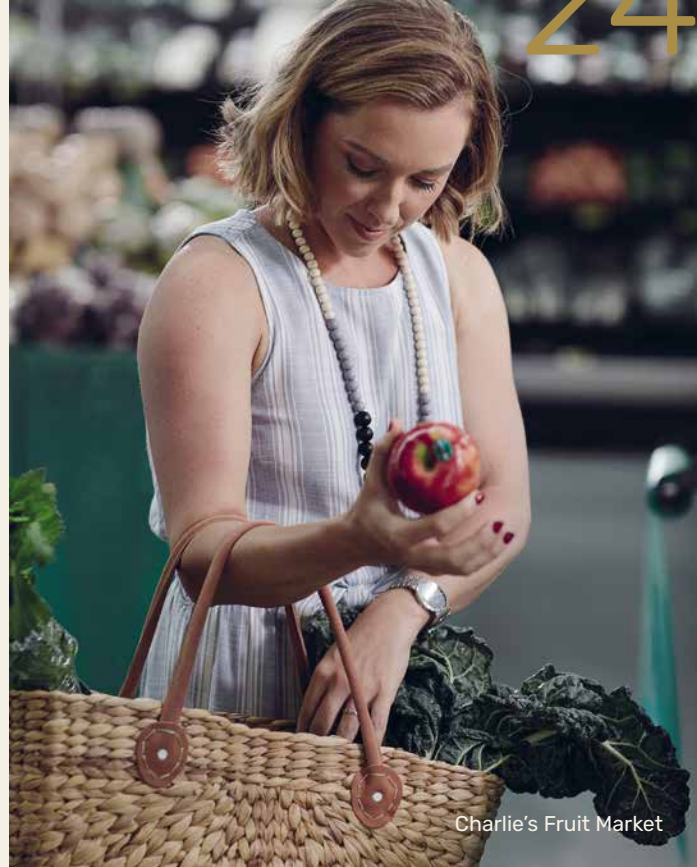
Charlie's Fruit Market