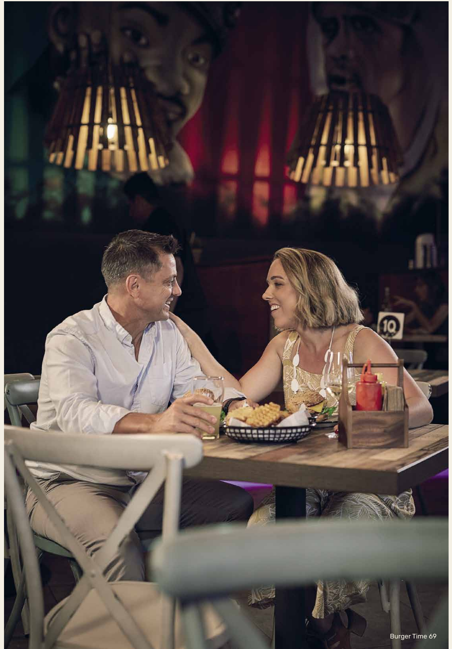
Burger Time 69

First established in 1969, Everton Plaza has undergone exciting upgrades to the shopping and dining precinct. Drop into gourmet grocer Neighbourhood Market Co., or satisfy your hunger at 5 Boroughs burger restaurant, Stellarossa café, Mexican street food delights from Comuna Cantina or award-winning pizza from Corbett and Claude.