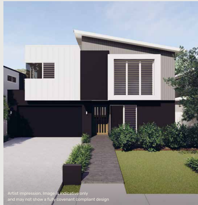
Artist impression. Image is indicative only and may not show a fully covenant compliant design