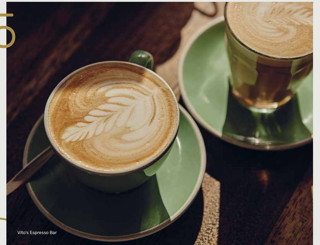
Vito's Espresso Bar