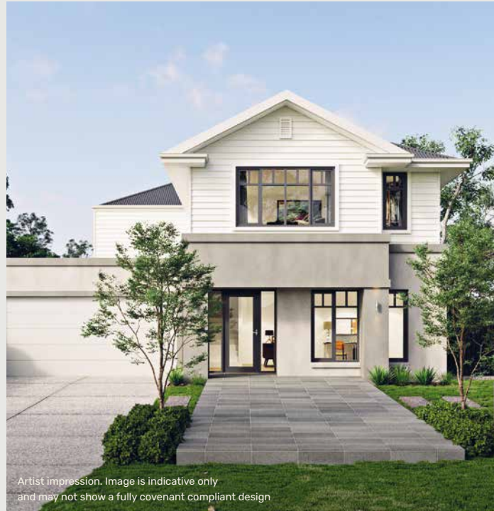
Artist impression. Image is indicative only and may not show a fully covenant compliant design