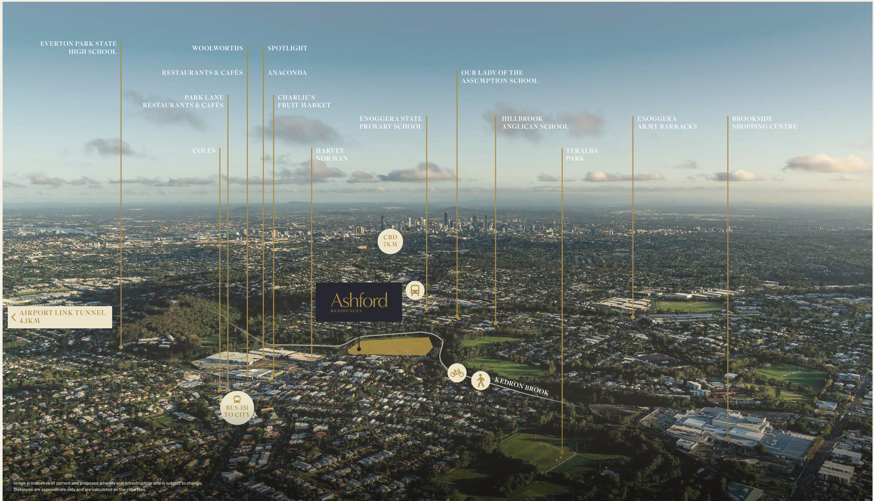
Image is indicative of current and proposed amenity and infrastructure and is subject to change. Distances are approximate only and are calculated as the crow flies.