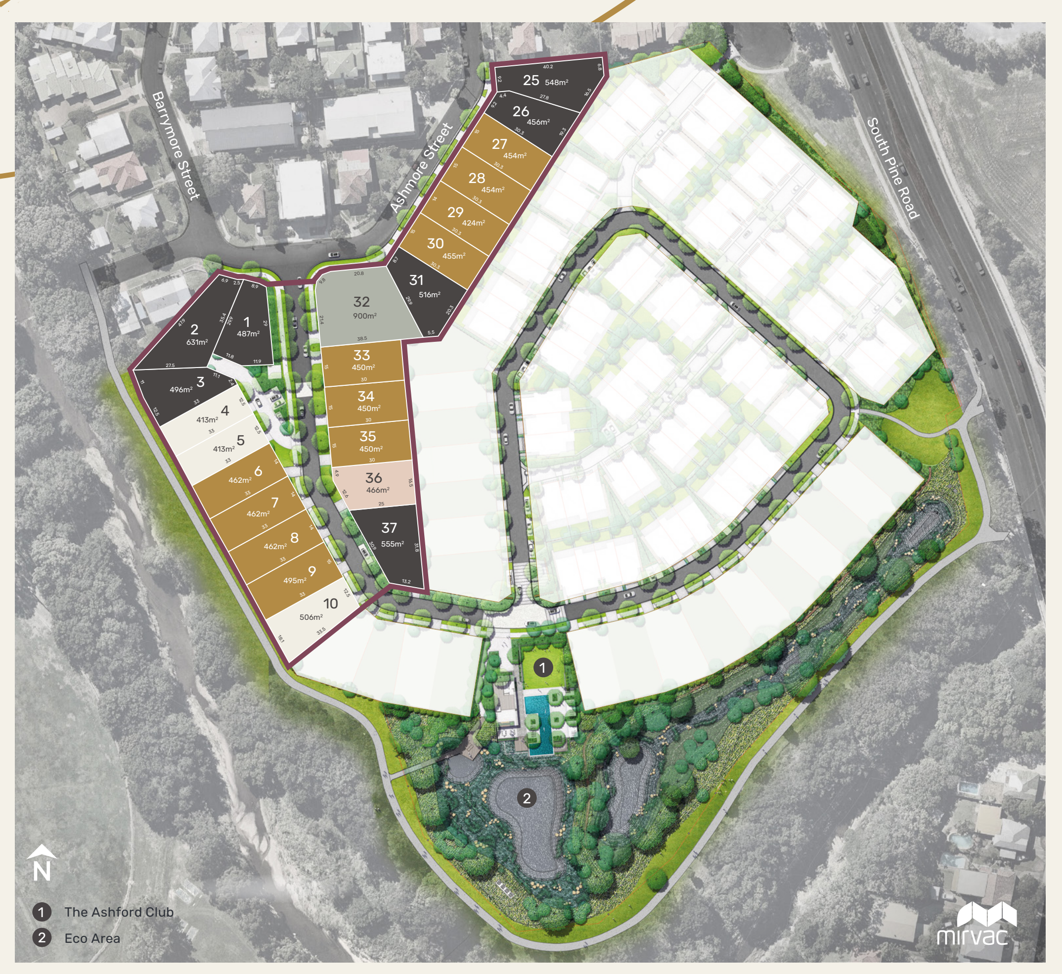
Important Information: This lot plan was prepared prior to construction and is indicative only and not intended to be a true representation of the final product as developed. This lot plan is believed to be correct as at October 2019, but is not guaranteed. Changes may be made to all aspects of the development (including, without limitation, to the layout, composition, streetscape, dimensions, specifications, service locations) during the development without notice. Dimensions are approximate only and may be the sum of multiple truncations. Lots may be subject to easements and covenants. The development is a staged development and not all facilities will be constructed as part of Stage One. The Eco Area and The Ashford Club depicted on the plan have been included for illustrative purposes only, do not form part of Stage One and will not be constructed as part of Stage One of the development. The development makes no representation or warranty in relation to the timing of the construction of The Ashford Club and Eco Area. Please refer to the contract plans and specifications, as this lot plan is forgeneral guidance only. Version 1 - October 2019.