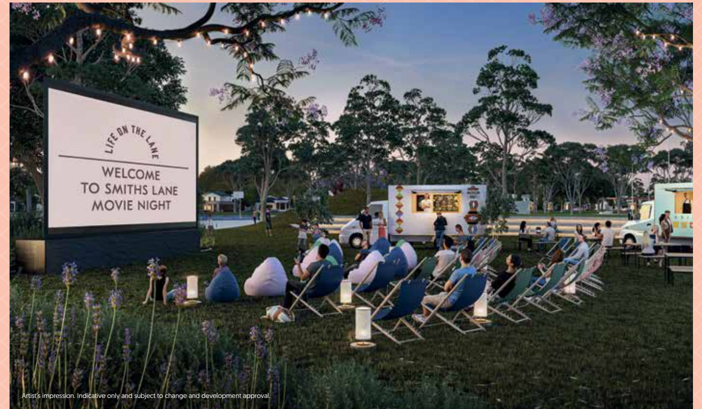
Artist's impression. Indicative only and subject to change and development approval.