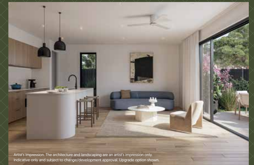
Artist's impression. The architecture and landscaping are an artist's impression only. Indicative only and subject to change/development approval. Upgrade option shown.

Each design detail is chosen with an ever-changing lifestyle in mind: from the open plan living areas with generous storage space, to the multi-purpose room that can flex with your family.