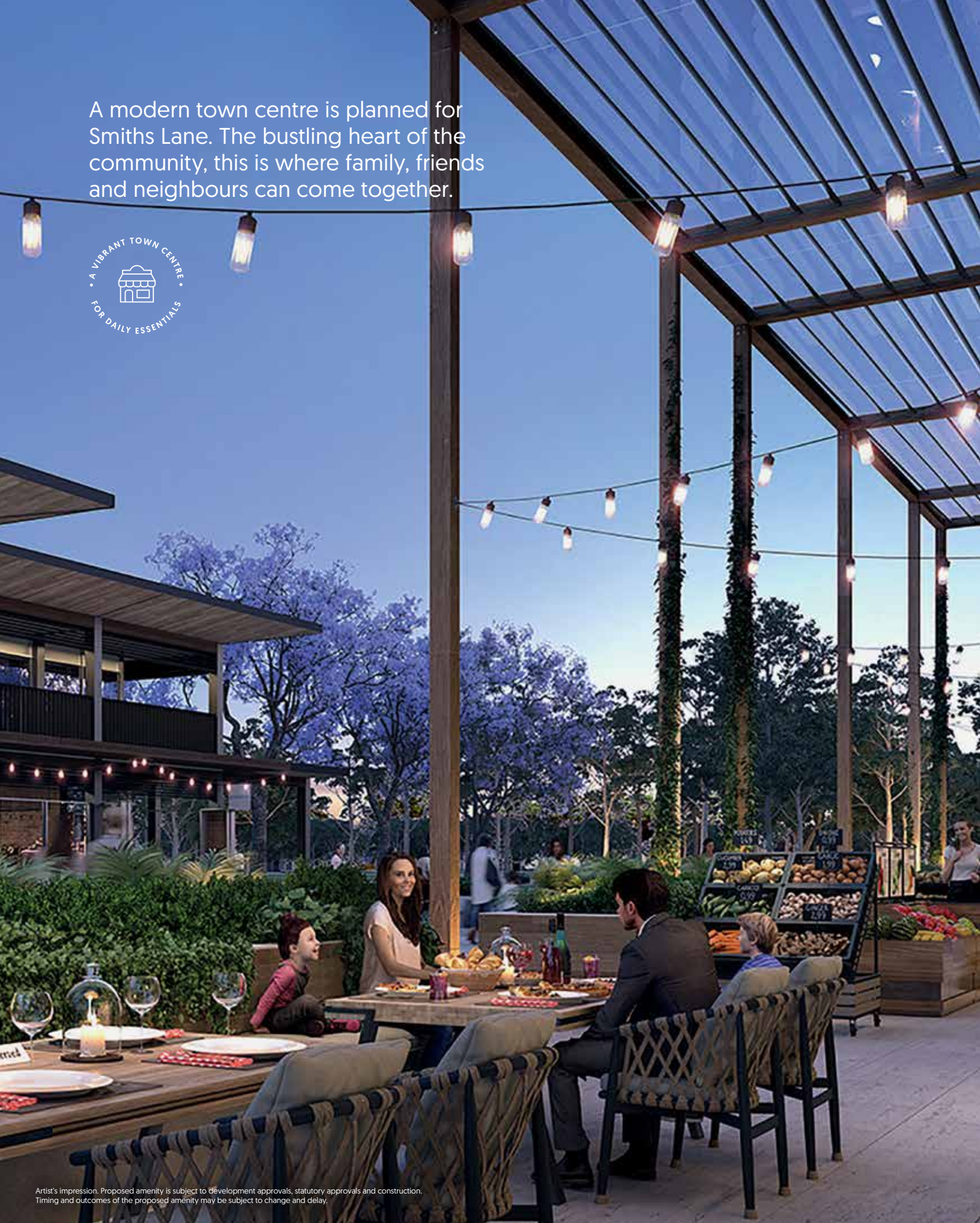
Artist's impression. Proposed amenity is subject to development approvals, statutory approvals and construction. Timing and outcomes of the proposed amenity may be subject to change and delay.