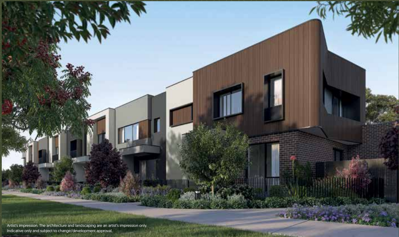
Artist's impression. The architecture and landscaping are an artist's impression only. Indicative only and subject to change/development approval.

Designed and delivered by Mirvac, Smiths Lane's Townhomes are uncompromising on style and space. Their modern architecture is inspired by the unique character of Cardinia Creek – reflecting and building upon local heritage and the environment through natural materiality and seasonal landscaping.