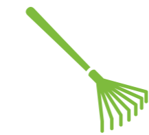
A Sturdy Rake