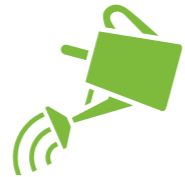
Metal Watering Can