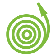
Gardening Hoses & Watering Wands