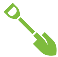
Spade / Shovel