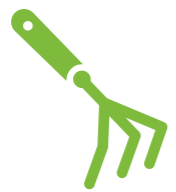
Three Pronged Weeding Tool