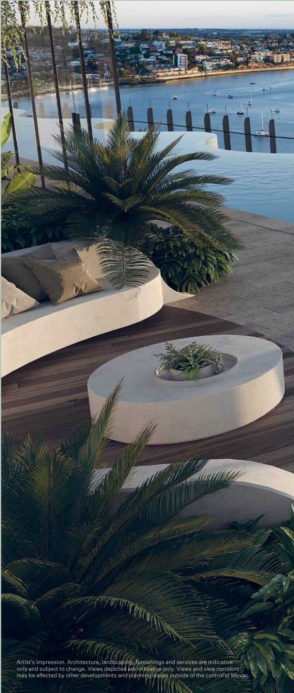
Artist's impression. Architecture, landscaping, furnishings and services are indicative only and subject to change. Views depicted are indicative only. Views and view corridors may be affected by other developments and planning issues outside of the control of Mirvac.