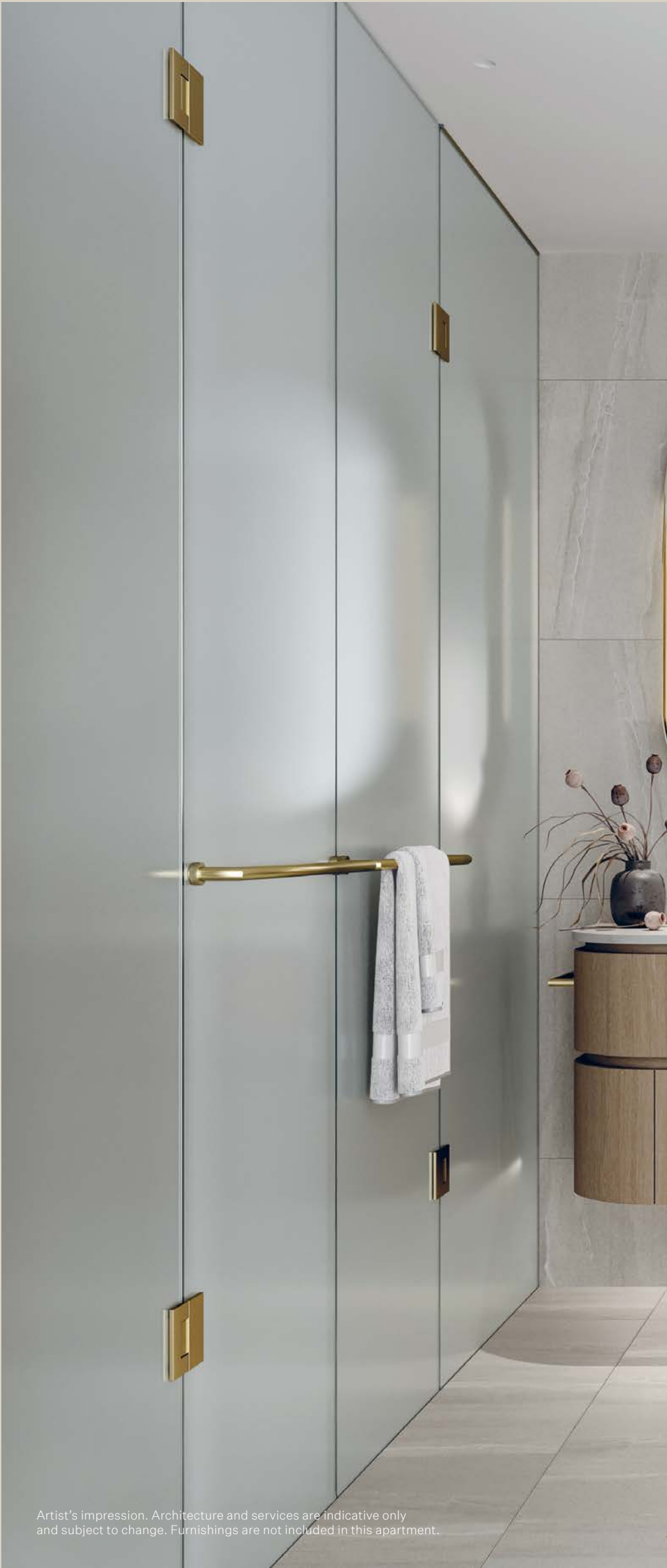
Artist's impression. Architecture and services are indicative only and subject to change. Furnishings are not included in this apartment.