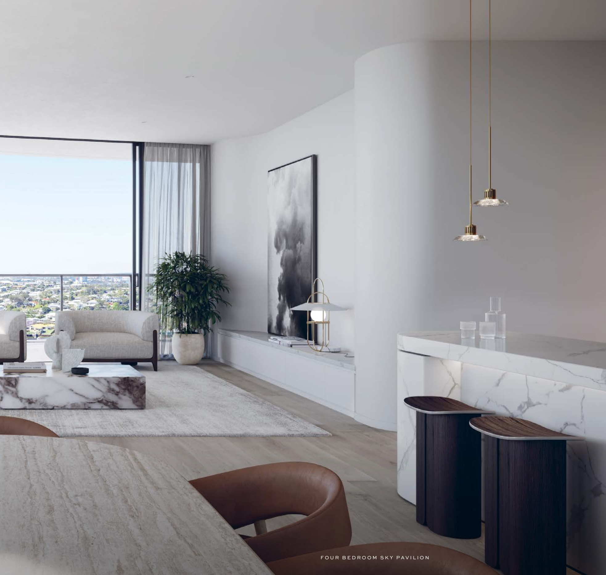
FOUR BEDROOM SKY PAVILION