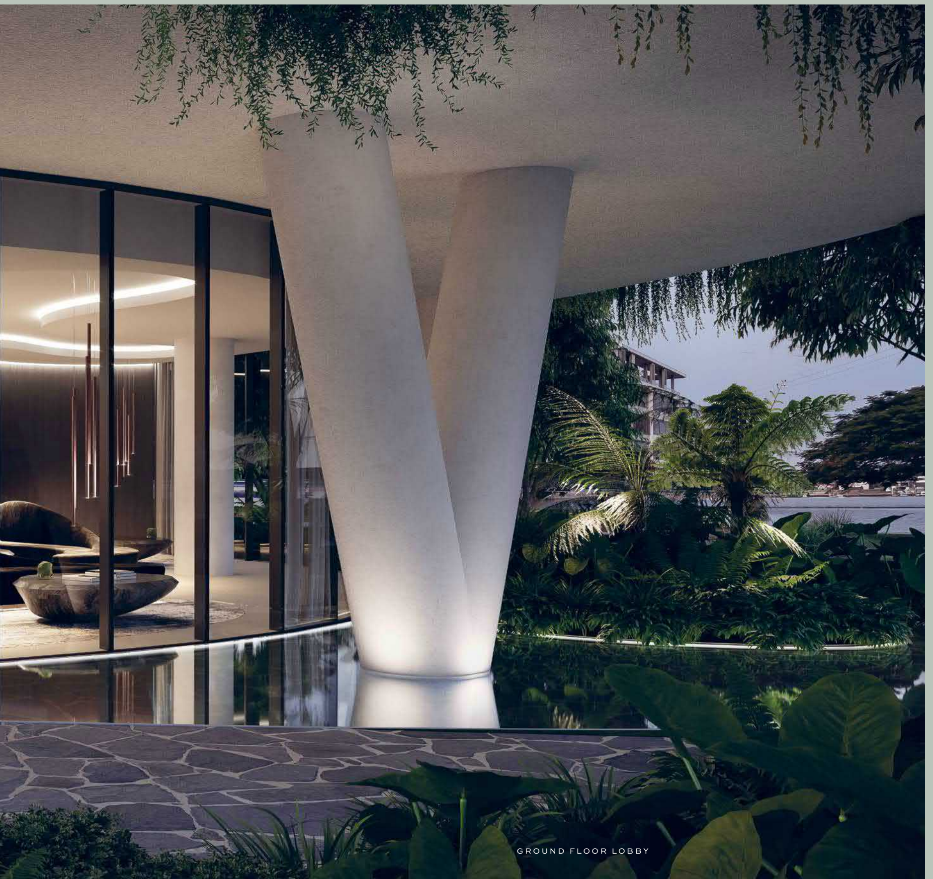
GROUND FLOOR LOBBY