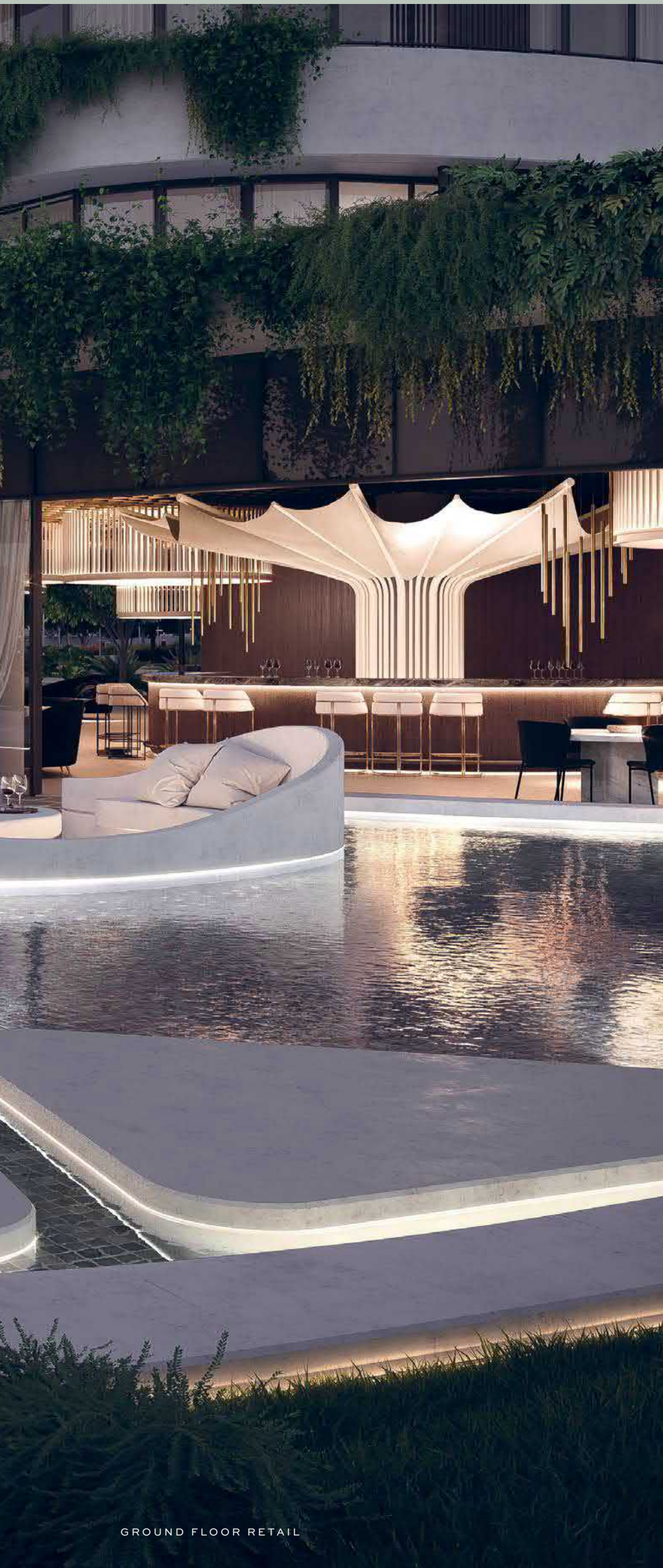
GROUND FLOOR RETAIL