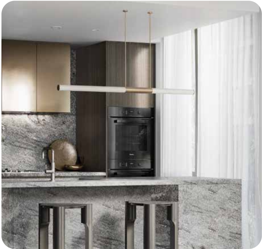
Artist's impression. Architecture and services are indicative only. Image shows upgraded finishes and fitting options. Furnishings included in this artist impression are not included in the apartment.

Feature pendant light above island bench