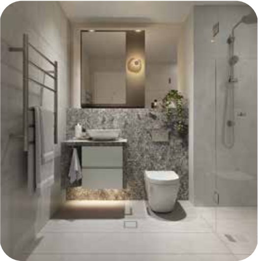
Typical ensuite bathroom shown. Artist's impression. Image shows upgraded finishes and fitting options. Furnishings included in this artist impression are not included in the apartment.

Heated towel rail to the main bathroom for 1 bedroom apartments and ensuite bathroom for 2 and 3 bedroom apartments. Finish to match tapware and fixtures.