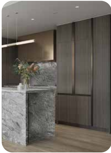
Artist's impression. Image shows upgraded finishes and fitting options. Furnishings included in this artist impression are not included in the apartment.

Fisher & Paykel integrated fridge/freezer. Integration panel will match specified kitchen joinery.