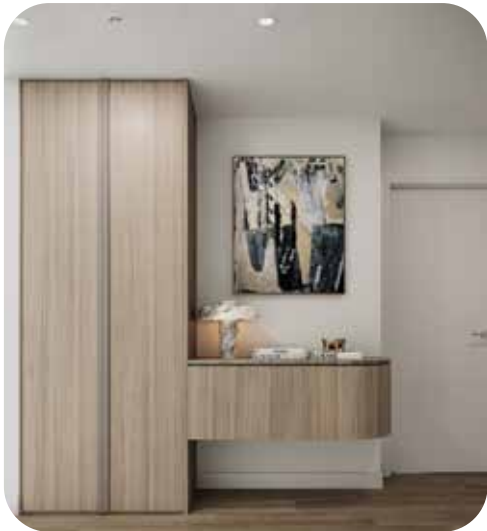
Artist's impression. Image shows upgraded finishes and fitting options. Furnishings included in this artist impression are not included in the apartment.

20mm stone benchtop to entry joinery in lieu of timber look benchtop. Not available to all apartments. Refer to sales plan for upgrade eligibility. Stone to match specifications from selected interior scheme.