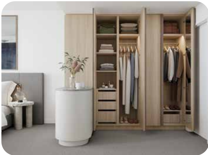
Artist's impression. Image shows upgraded finishes and fitting options. Furnishings included in this artist impression are not included in the apartment.

Timber look internal shelving and drawers in lieu of melamine, addition of low height shelf, shoe drawers and LED lighting. Applicable to the master bedroom only. Joinery to match specifications of selected interior scheme.