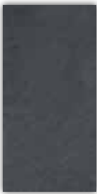
Impera Black Artist's impression. Image is indicative only.