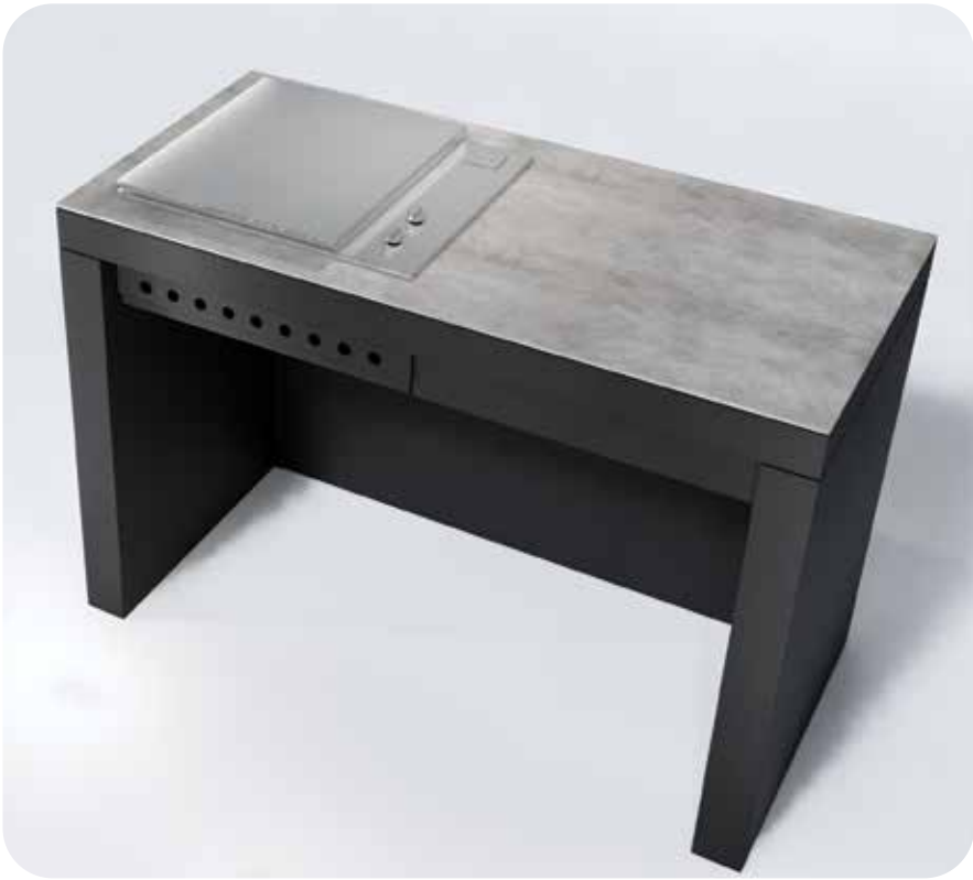
Artist's impression. Image of Small BBQ upgrade shown with flat lid and Cosmopolita Grey porcelain benchtop. Image is indicative only.

Artusi outdoor kitchen with feature porcelain benchtop, gas barbeque and lid available in small or large size^ in 3 benchtop colour variations; Impera Black, Torano Statuario and Cosmopolita Grey. ^ Upgrade not available to all apartments, refer to your sales consultant for eligibility.