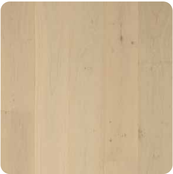
Engineered timber floorboards to kitchen/living/dining/corridors in lieu of tiles.

By selecting any of the timber floor boards upgrades, the purchaser accepts the following: