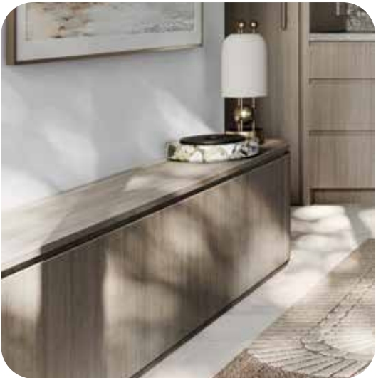
Artist's impression. Image shows upgraded finishes and fitting options. Furnishings included in this artist impression are not included in the apartment.

Timber look low height TV joinery. Joinery to match specifications from selected interior scheme.