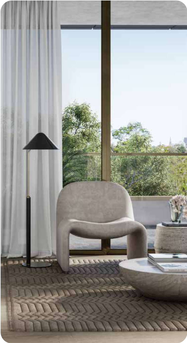
Artist's impression. Image shows upgraded finishes and fitting options. Furnishings included in this artist impression are not included in the apartment.

Sheer curtains to all windows in addition to blackout blinds to all windows (blackout blinds provided as standard).