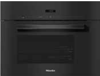
60cm Miele built-in steam oven. In lieu of secondary oven to 3 bedroom apartments.