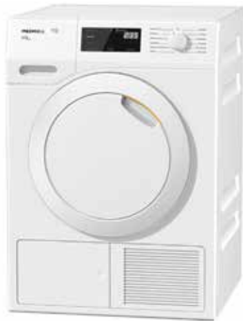
Miele heat pump dryer.

Artusi outdoor kitchen with feature porcelain benchtop, gas barbeque and lid available in small or large size^ in 3 benchtop colour variations; Impera Black, Torano Statuario and Cosmopolita Grey. ^ Upgrade not available to all apartments, refer to your sales consultant for eligibility.