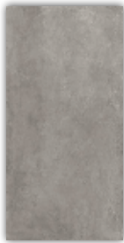
Cosmopolita Grey Artist's impression. Image is indicative only.