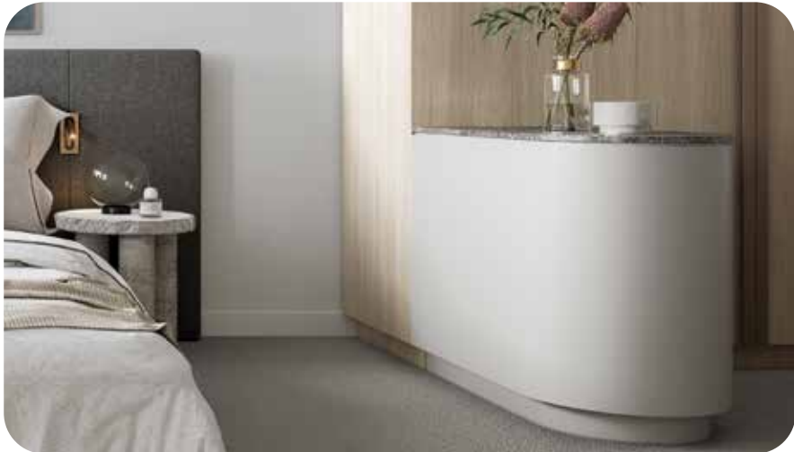
Artist's impression. Image shows upgraded finishes and fitting options. Furnishings included in this artist impression are not included in the apartment.

20mm stone benchtop to nightstand joinery in lieu of coloured joinery benchtop. Stone to match specifications from selected interior scheme.