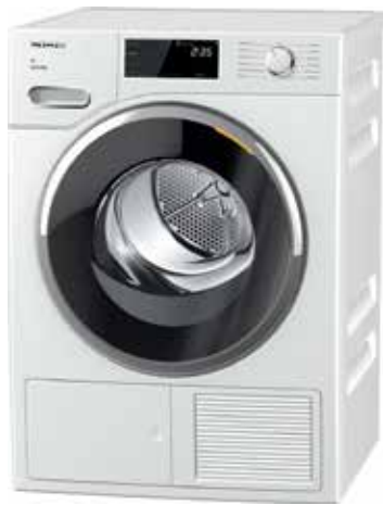
Miele front loading washing machine.