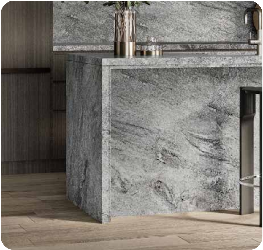
Artist's impression. Architecture and services are indicative only. Image shows upgraded finishes and fitting options. Furnishings included in this artist impression are not included in the apartment.

Joinery, stone and finishes to match specifications from selected interior scheme.