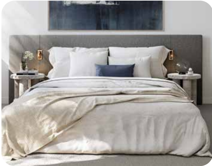
Artist's impression. Image shows upgraded finishes and fitting options. Furnishings included in this artist impression are not included in the apartment.

Custom queen bed sized fabric bedhead and integrated feature lights to match specified interior scheme. Applicable to the master bedroom only. Can be made available to suit a king bed, refer to sales plan for eligibility.