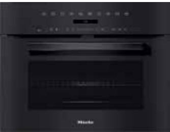
60cm Miele built-in combination microwave and oven. In lieu of microwave.