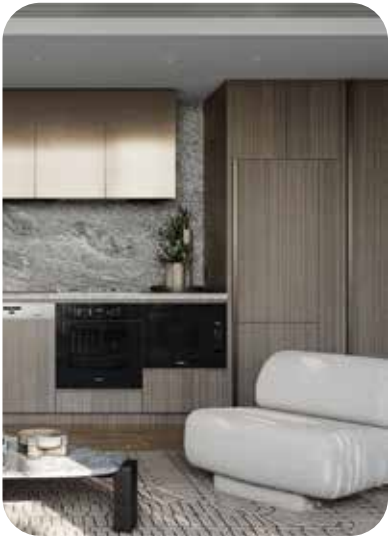
Artist's impression. Image shows upgraded finishes and fitting options. Furnishings included in this artist impression are not included in the apartment.

Fisher & Paykel integrated fridge/freezer. Integration panel will match specified kitchen joinery.