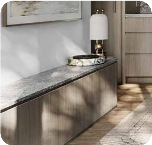
Artist's impression. Image shows upgraded finishes and fitting options. Furnishings included in this artist impression are not included in the apartment.

20mm stone benchtop to low height TV joinery in lieu of timber look benchtop. Stone to match specifications from selected interior scheme.