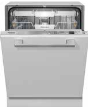
60cm Miele fully integrated dishwasher. In lieu of semi-integrated dishwasher. Integration panel will match the specified kitchen joinery panel.

*Included as standard in 3 bedroom apartments.