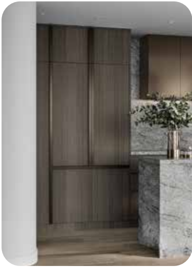
Artist's impression. Image shows upgraded finishes and fitting options. Furnishings included in this artist impression are not included in the apartment.

Fisher & Paykel integrated fridge/freezer. Integration panel will match specified kitchen joinery.