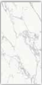
Torano Statuario Artist's impression. Image is indicative only.