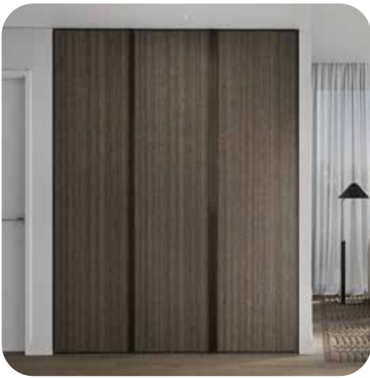
Artist's impression. Image shows upgraded finishes and fitting options. Furnishings included in this artist impression are not included in the apartment.

Full height timber look joinery with internal melamine shelving. Joinery to match specifications from selected interior scheme. Not available to all apartments, refer to sales plan for upgrade eligibility.