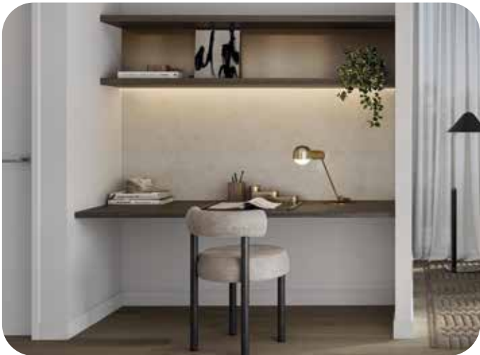
Artist's impression. Image shows upgraded finishes and fitting options. Furnishings included in this artist impression are not included in the apartment.

Timber look floating desk and open shelving with feature metallic panel and pinboard. Joinery and finishes to match specifications from selected interior scheme. Not available to all apartments, refer to sales plan for upgrade eligibility.