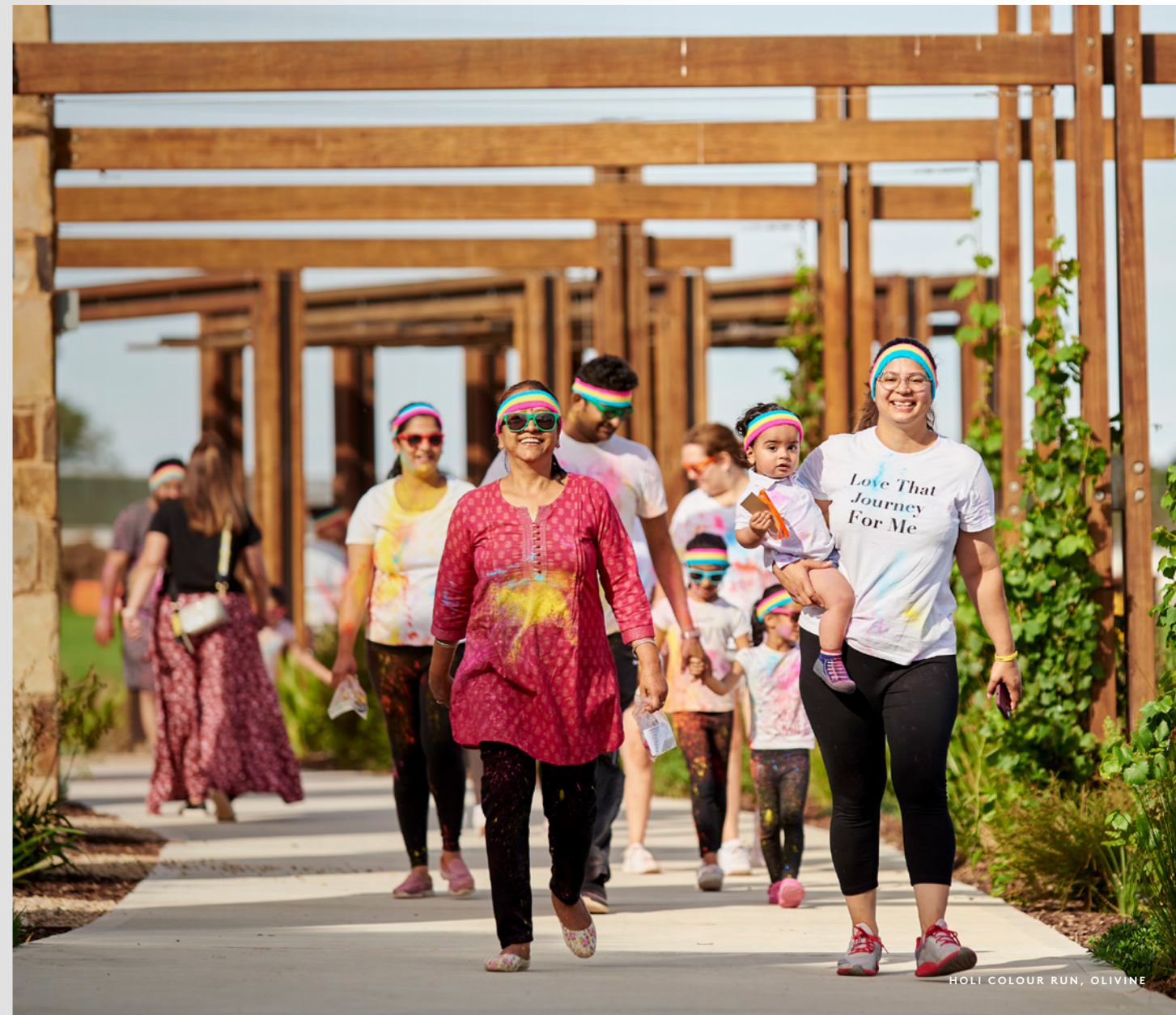
HOLI COLOUR RUN, OLIVINE

Mirvac's commitment to quality goes beyond design, construction and community initiatives. We aim to make your move to Olivine a smooth and enjoyable experience, beginning with Mirvac's dedicated Customer Relationship and Settlement Team, and Community Placemaker.