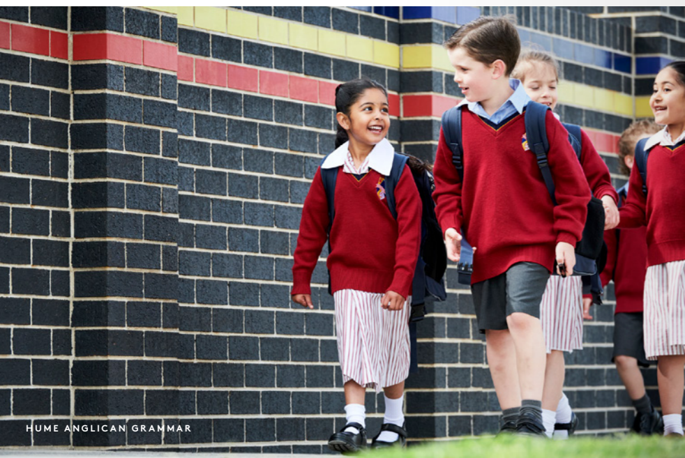
HUME ANGLICAN GRAMMAR