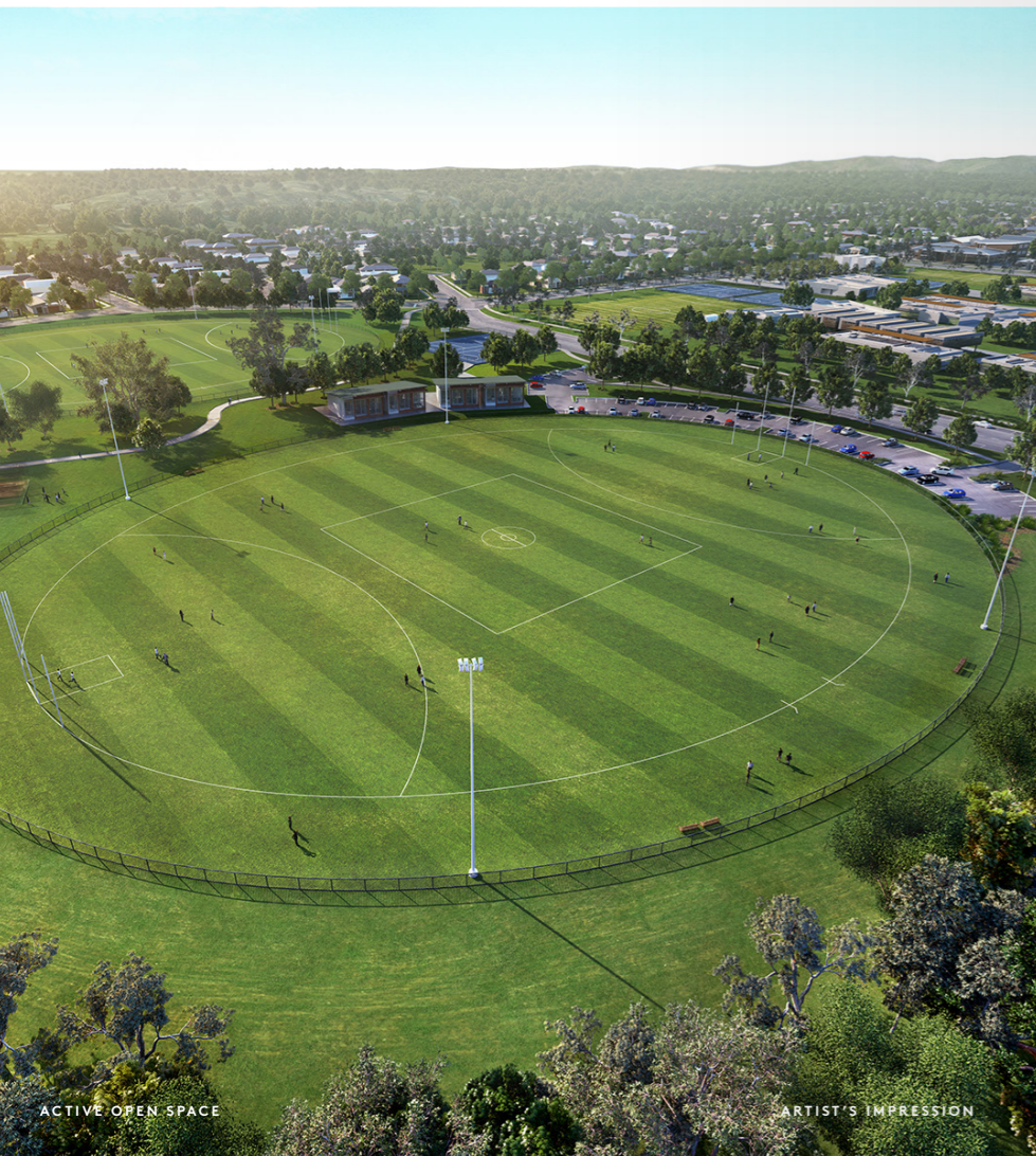
ACTIVE OPEN SPACE