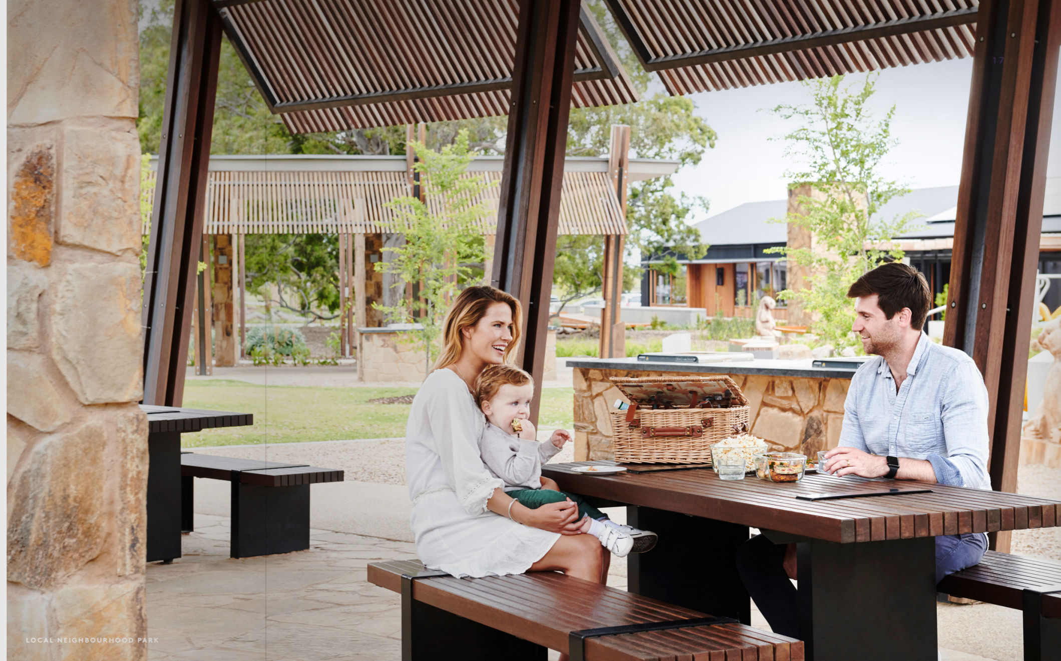
LOCAL NEIGHBOURHOOD PARK

Enjoy quality living from day one. Mirvac has already delivered great amenity at Olivine, with much more to come.