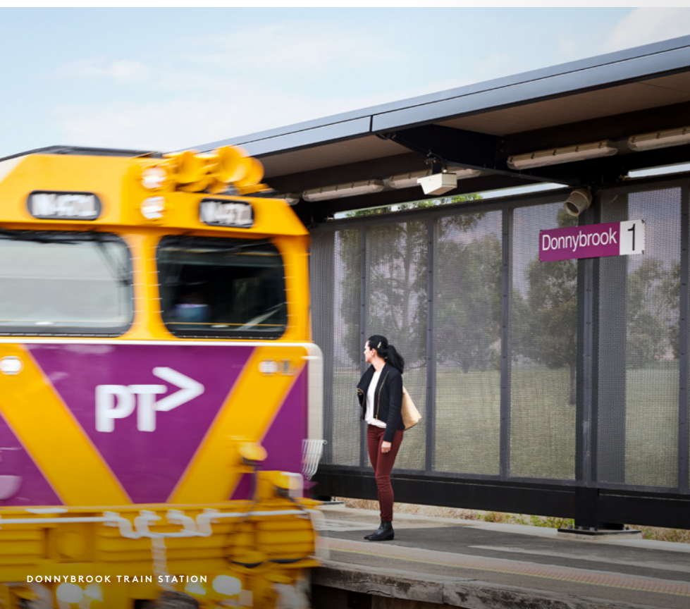
DONNYBROOK TRAIN STATION