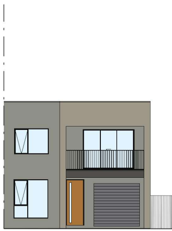
Front Elevation Palette Number 2