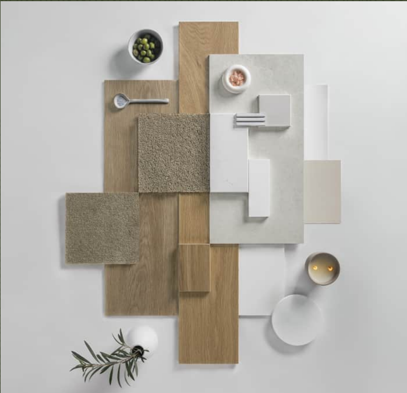
Oak Scheme – Fresh and Distinguished

Inside your Smiths Lane Townhome, experience a harmonious balance of high quality and low maintenance. Natural colour palettes with timber and stone finishes create warmth and a timeless appeal, allowing you to add your individual style.