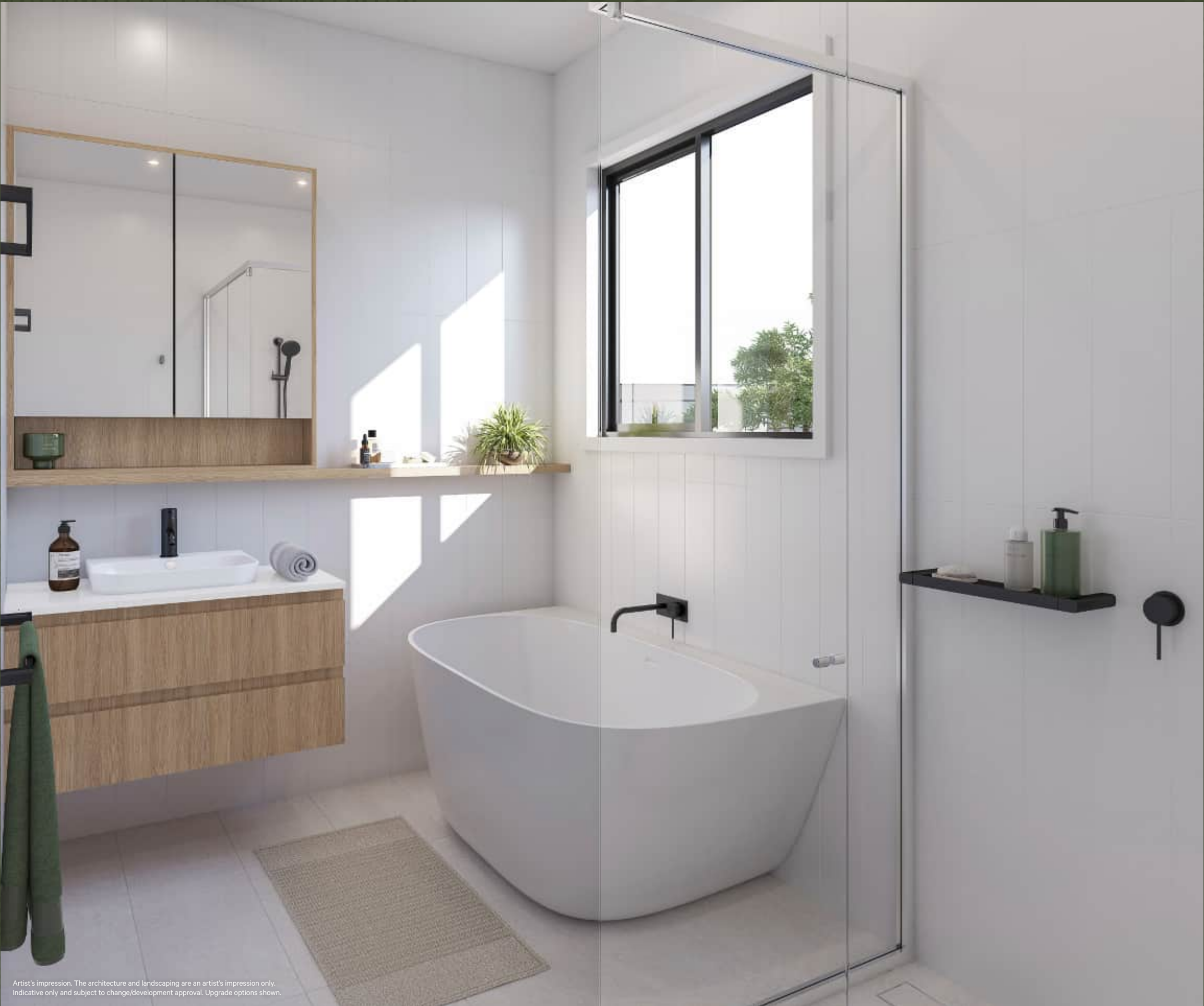
Artist's impression. The architecture and landscaping are an artist's impression only. Indicative only and subject to change/development approval. Upgrade options shown.