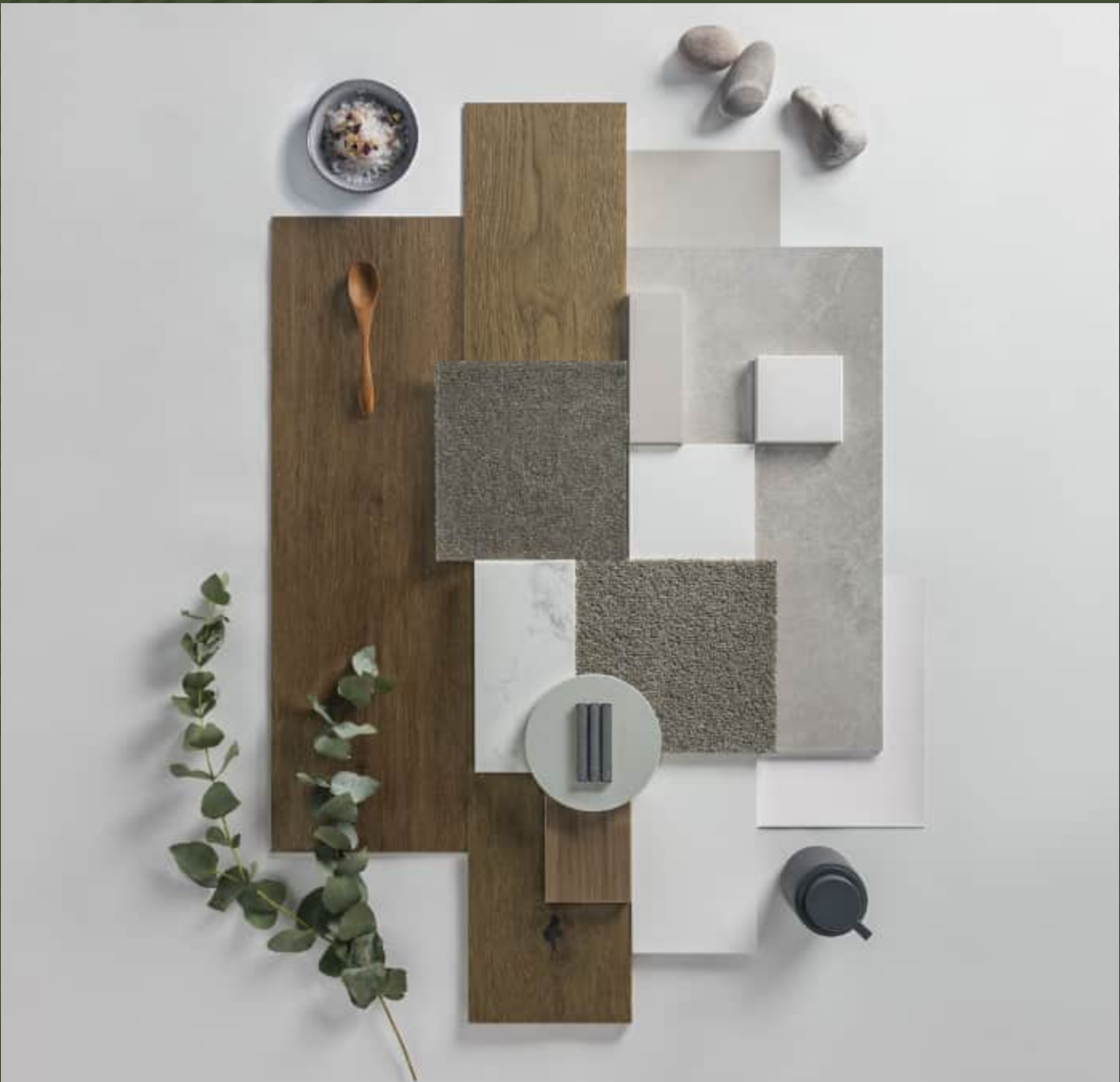
Walnut Scheme – Warm and Sophisticated

With contemporary fresh joinery and white mosaic splashback tiles within the kitchen, the Oak palette blends soft tones of warm natural timber with the warm white, soft textured surfaces of the reconstituted stone.