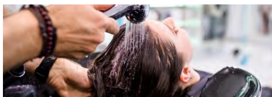
STEFAN HAIR TOOMBUL

10% off everything takeaway , plus phone through your order and the Niku Ramen team can deliver it to your store