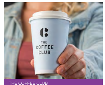
THE COFFEE CLUB

Free home delivery to customers who spend over $30 and live in local suburbs.