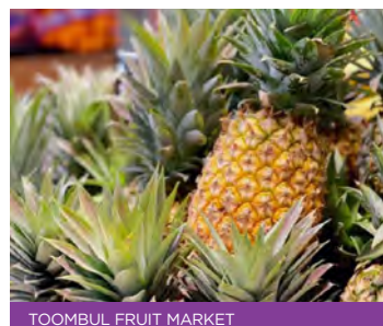
TOOMBUL FRUIT MARKET

Some offer examples we've seen so far include: